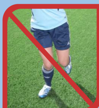
KNEE POSITION INCORRECT