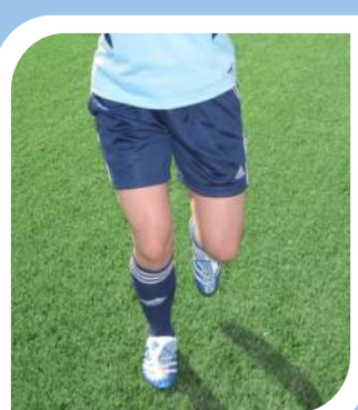
KNEE POSITION CORRECT

Jog 4-5 steps, then plant on the outside leg and cut to change direction. Accelerate and sprint 5-7 steps at high speed (80-90% maximum pace) before you decelerate and do a new plant & cut. Do not let your knee buckle inwards. Repeat the exercise until you reach the other side, then jog back. 2 sets